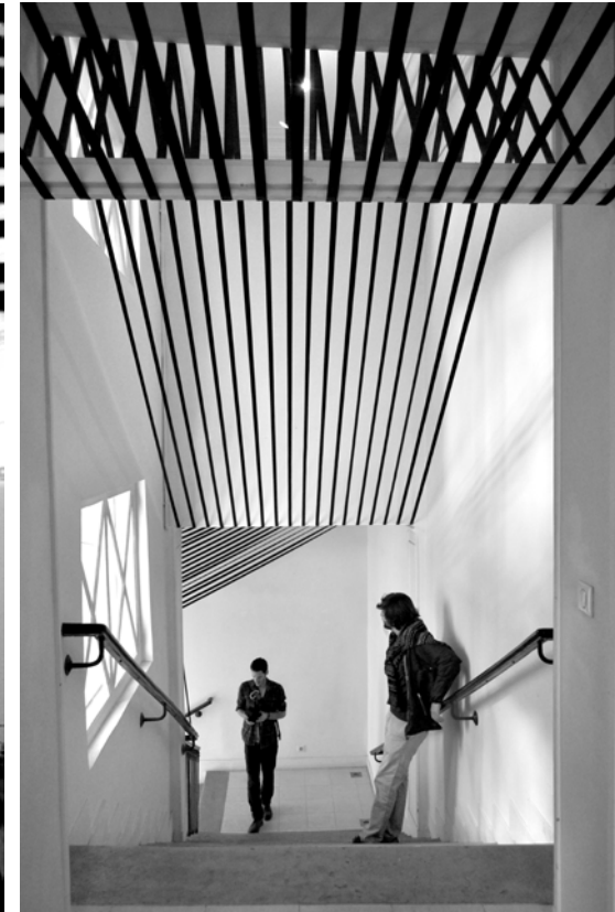
Haute tension Concept